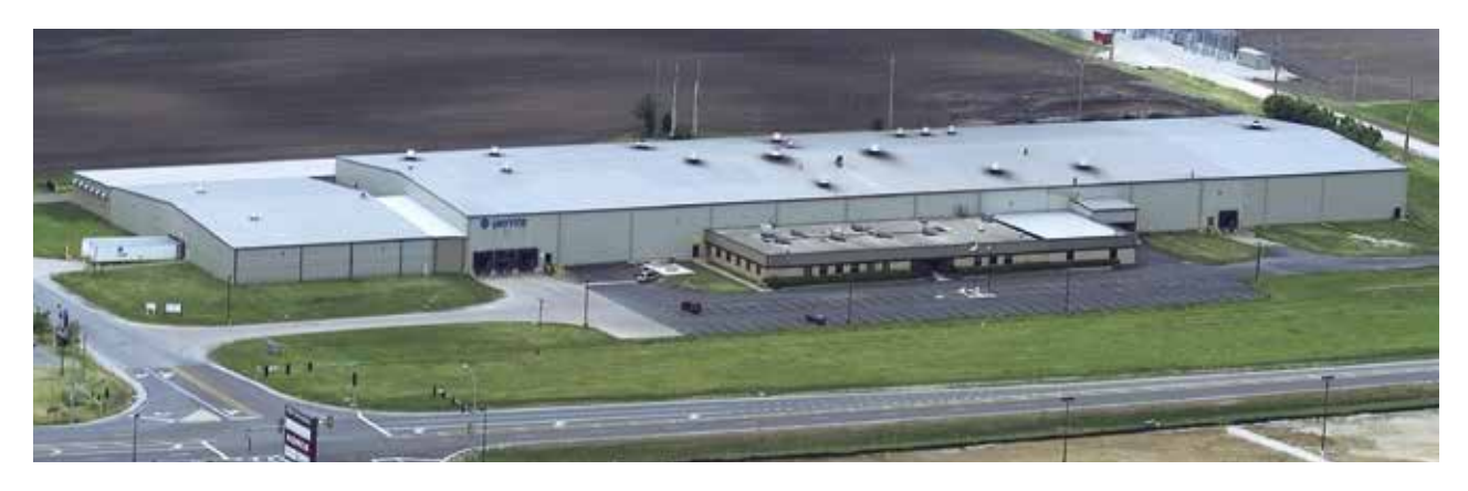
Unytite, Inc. was established in 1986. A modern 200,000 sq. ft. facility is located in Peru, Illinois, 90 miles from Chicago, to manufacture products to supply the Construction, Heavy Equipment, Truck and Trailer, Automotive, Alternative power, Railroad, Motorcycle and ATV industries. Unytite's unique capabilities include Cold Forming, Hot Forming, Press Forging, Machining, Heat Treatment and Assembly under one roof. All material used is melted and manufactured in the USA.